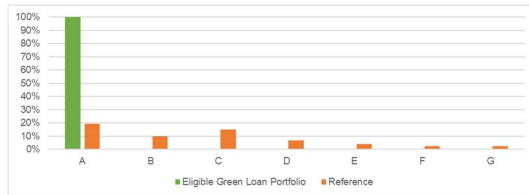
Figure 1: Distribution of energy labels Eligible Green Loan Portfolio and residential buildings in the Netherlands

than 10% threshold set for a Nearly Zero Energy Building (NZEB) are also included in the Eligible Green Loan portfolio.